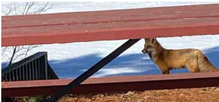
"Freddy the Fox" at the Rec. Center picnic table

To: All the co-editors who submitted articles for this edition of the newsletter.