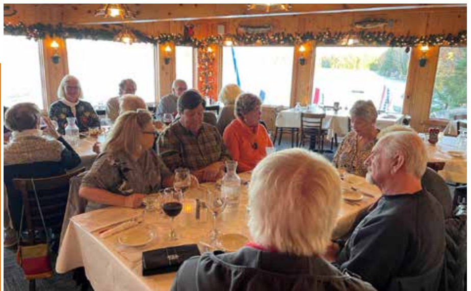
Dinner at Four Seasons Supper Club

https://watch.hgtv.com/tv-shows/lakefront-bargain-hunt/full-episodes/many-options-in-minocqua