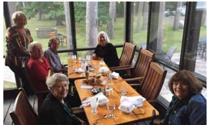
Dinner at Norwood Pines Supper Club (above and at right)

An HGTV episode was filmed here in October 2019 with the HGTV crew and a drone. It features four locations in the Minocqua area, including our very own Brandy Lake Condos. Grab some popcorn and enjoy!