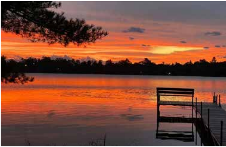
Another beautiful sunset over Brandy Lake