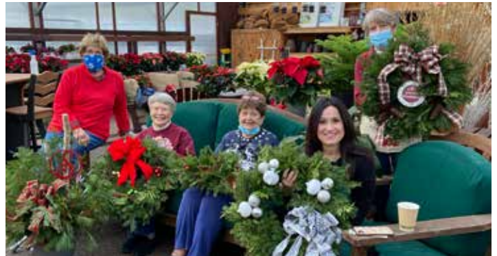
Previous Holiday Decorating Party

Class is limited to 10 people. Please R.S.V.P. with your item choice by November 15 to cspfeiffer40@gmail.com , or text your choice to 715-490-3498.