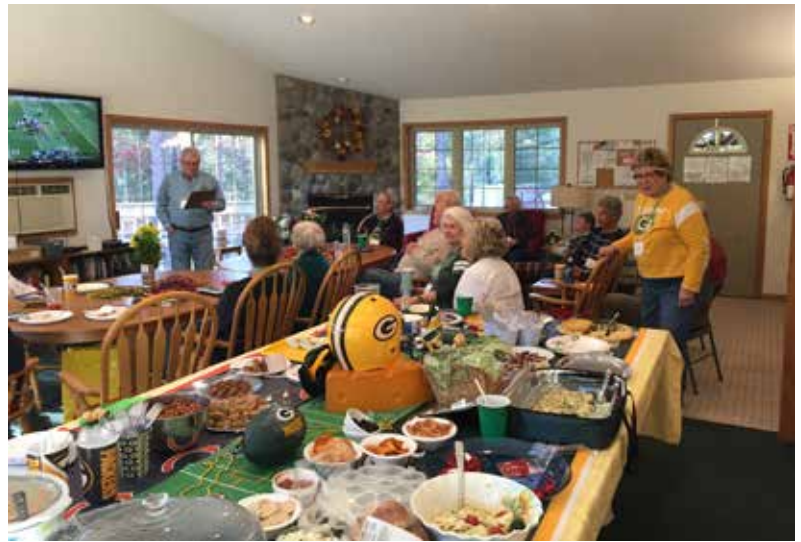
"After": a Wonderfully full table

The annual Packers-Bears party is great fun, and becoming quite the tradition at Brandy Lake!