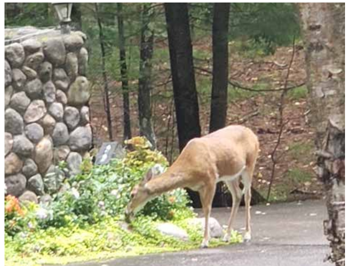
An unexpected visitor to Brandy Lake Condominiums