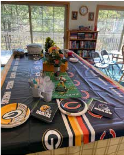
"Before": A Beautifully Set Table

The annual Packers-Bears party is great fun, and becoming quite the tradition at Brandy Lake!