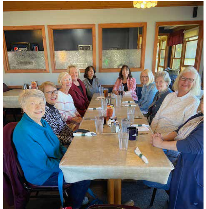
Brandy Breakfast Club at the Wild Boar in September, 2021