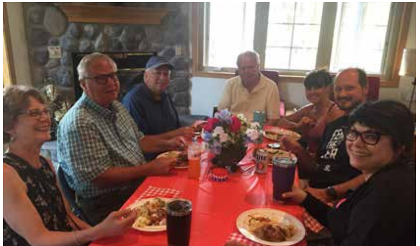
Owners, former residents, and guests enjoy the Annual Pot Luck on the evening of the Annual Meeting. Good food, good neighbors, and good friends!!!